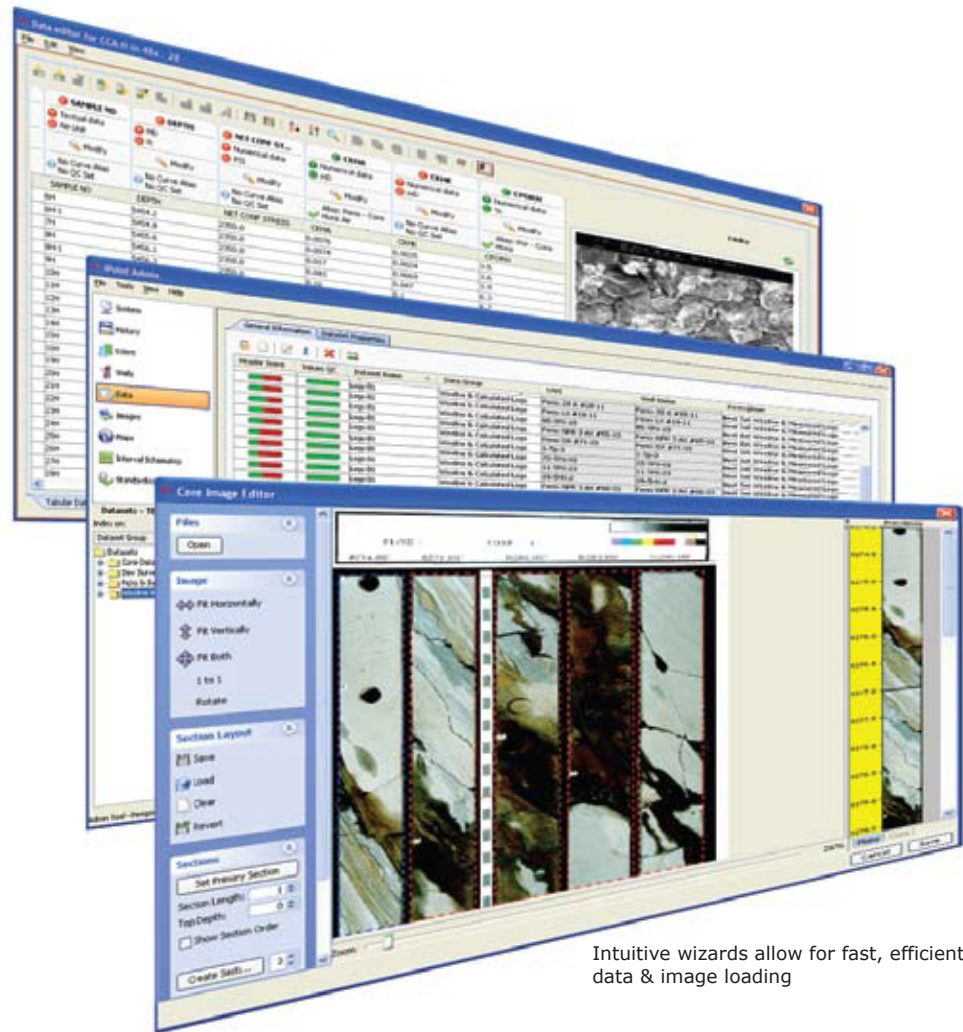
Intuitive wizards allow for fast, efficient data & image loading

The iPoint Admin Toolkit gives the admin user full control of their internal iPoint system, from data loading and QC to corporate database connection & project-view configuration.